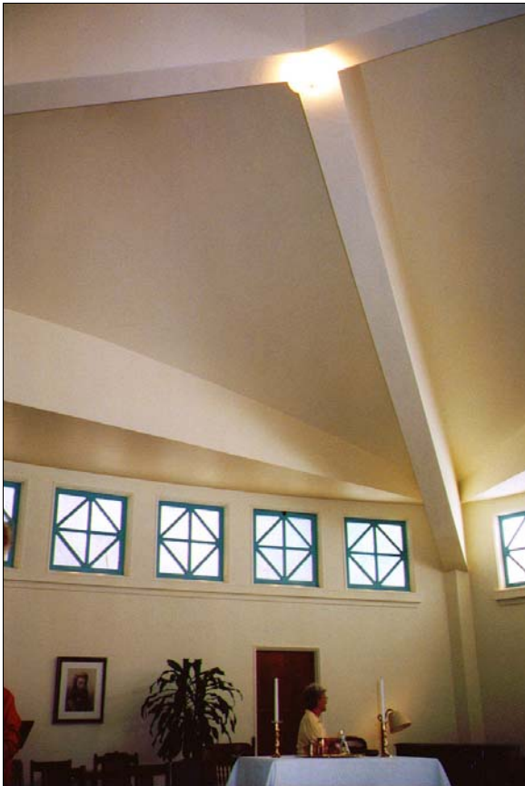
Interior, Blue Star Memorial Temple

I will endeavor to realize the Presence of the Avatar as a Living Power in my life.