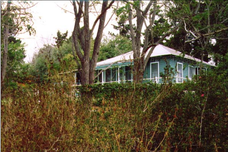
The Open Gate